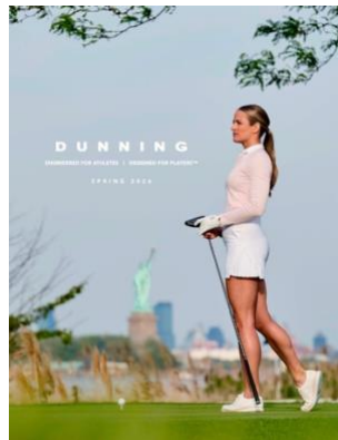
SPRING 2026 WOMEN'S